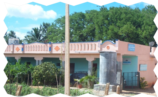
Transitional Home in Kattamnallur

In response to the alarming rate of increase in the incident of cases of mental illness especially among women, Vision India has been running a home called Abayashram in Kattamnallur Village in a rented building. This area of relief and rehabilitation of mentally challenged and vagrant women has of late commands utmost priority for Vision India.