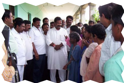
Visit of Mr. Aravind Limbavali Minister of Higher Education Govt. of Karnataka