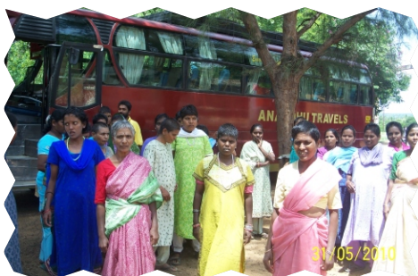
A picnic to Kaiwara