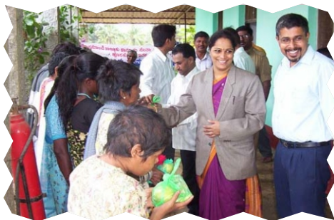
Visit of Justice Yeramel Kalpana